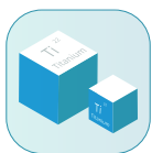
Platinum Coated Titanium Plates