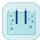
PEM Membrane Technology