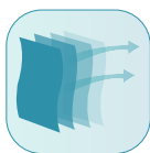
Patented 4 Stage Anti-Microbial Filter